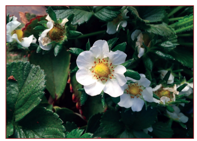
Figure 7: The strawberry flower has male and female parts and is generally self-pollinating. Wind and bees can improve pollination.

Although the fruit resembles a conical berry, the fruit is more correctly identified as an accessory fruit or pseudo fruit, formed from an enlarged flower receptacle embedded with the many tiny ovaries or achenes. Achenes resemble tiny seeds on the outside of the berry. New varieties of strawberries come from controlled pollination and planting selected seeds, whereas genetically identical plants arise from the runners off the mother plant.