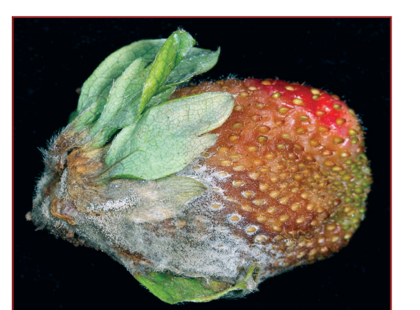
Figure 19: Botrytis grey mold is prevalent in all environments and especially during cool, wet weather. Higher humidity levels in high tunnels may increase berry infection.

Ensure that transplants are disease-free before planting. Purchase plants from reliable sources and inspect them for any signs of infection. When outside conditions are suitable for plant growth, raising the sides of high tunnels will improve air circulation and reduce inside humidity.