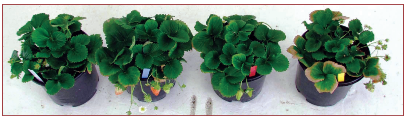
Figure 11: Increasing salinity levels (from left to right) show increasing symptoms of leaf yellowing and marginal burning.

Overall salinity is the concentration of total dissolved solids (TDS) in water. In farming, overall salinity is commonly estimated by the electrical conductivity (EC) of the irrigation water or a soil sample and is directly related to the concentration of salts.