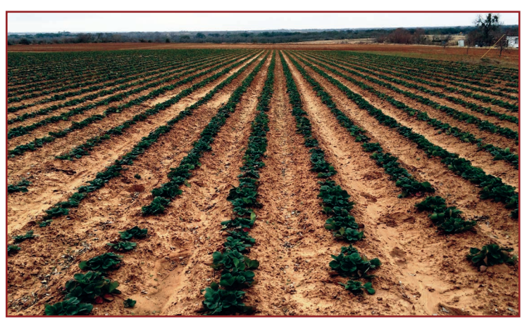
Figure 2: Typical strawberry field production in South-central Texas includes bare-rooted plants and furrow irrigation.

The average annual acreage in Texas from 1937 to 1946 was 1,360 acres. Smith and Wood counties in East Texas along with the coastal area below Houston and