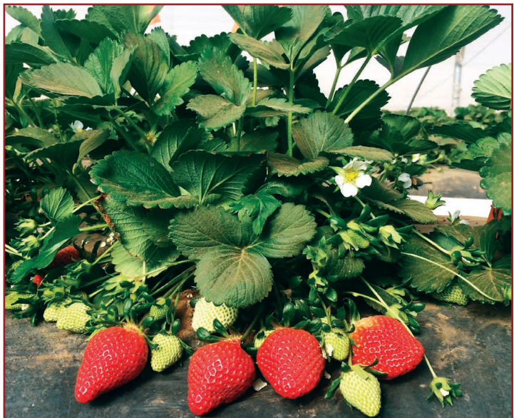
Figure 6: A healthy strawberry plant with leaves, blossoms, developing fruit, and mature berries.

Strawberry plants develop predictably in phases. Dormant crowns will form new roots and leaves; then flower and bear fruit. Plants will then stop flowering and form runners and daughter plants in that sequence. Soil and air temperatures affect the timing and duration of the different phases. Though strawberries generally grow and develop best at 70 to 75°F, strawberry breeders have produced varieties that grow and bear fruit in somewhat cooler or warmer climates.