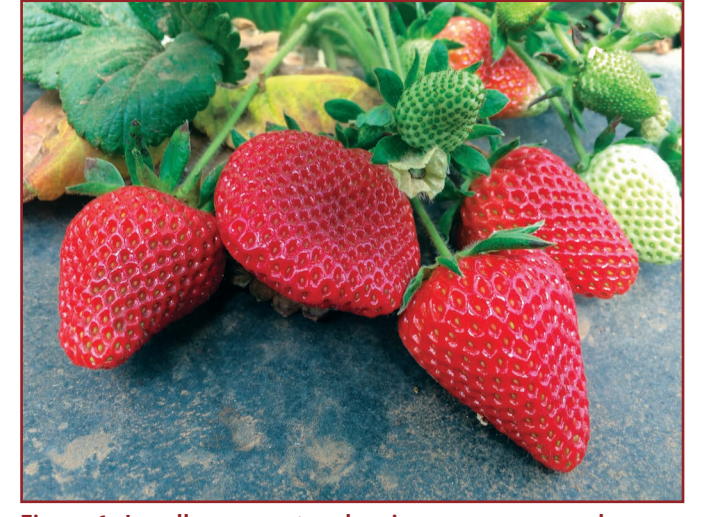
Figure 1: Locally grown strawberries are a very popular crop; however, they can be difficult to find in many areas of Texas.

Equipment for different production systems can be very expensive and should be researched thoroughly. Row spacing, plastic mulch, and pest control spray equipment may require additional specialized equipment. Wildlife can also be a serious problem in strawberries—they feed on the leaves, flowers, and fruits. Growers must plan for wildlife control for before planting.