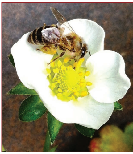
Figure 9: Honeybees will help improve pollination and overall quality of the berries.

Bee activity also depends on flowering patterns. When the crop does not have enough flowers, bees will go elsewhere. This reduces their efficiency when strawberries are in full bloom. Mow nearby weeds regularly to keep them from flowering and competing with the strawberry crop. Use insecticides cautiously and do not spray them directly onto the crop during peak bee activity.