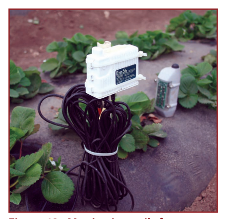
Figure 12: Monitoring soils for appropriate moisture levels will increase water use efficiency and reduce potential root diseases.