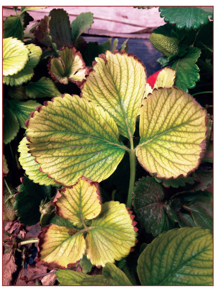
Figure 10: High pH soils may influence nutrient uptake resulting in a deficiency or toxicity. These leaves suggest iron deficiency.

The need for supplemental N or other nutrients and rates to apply on strawberries can be refined