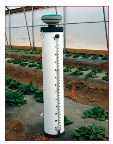
Figure 13: Atmometers are popular for measuring soil moisture levels. They offer a simple way to measure on-site evapotranspiration.