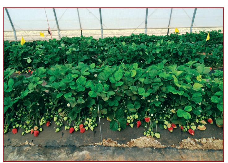
Figure 8: Short-day variety 'Festival' laden with berries in early April in Lubbock.

Long-day or everbearing varieties initiate flowers when day length is 12 hours, but struggle to flower consistently at temperatures above 90°F. These conditions are common in Texas during the summer months so everbearing varieties are generally not suited for open-field production. They are