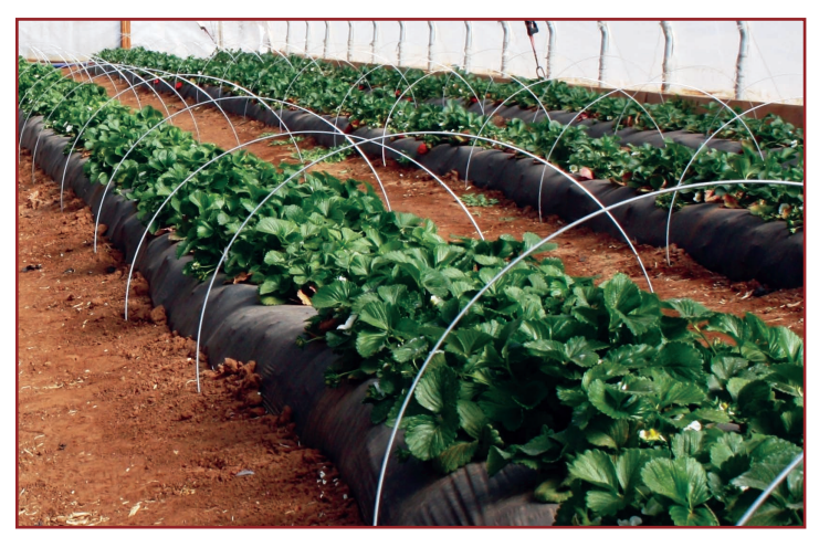
Figure 4: Raised beds with drip irrigation and plastic mulch are an important method in annual strawberry production.

be firm and uniform, and plastic mulch should be laid tightly over the bed to keep it from tearing during high winds (Fig. 4). Loose plastic can damage plants, and it takes time and effort to replace it. If investing in new or used equipment, be prepared to spend $5,000 to $10,000 or more.