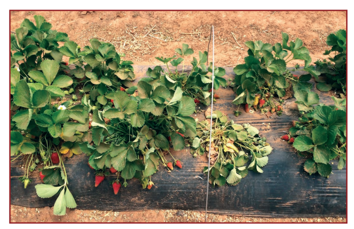
Figure 20: Strawberries are susceptible to root diseases. Some of these diseases may spread through irrigation water.

Root rot from P. fragariae causes a red discoloration of the stele (core) of the root. P. citricola is aggressive and may kill the plant rapidly. Other Phytophthora species cause problems only in low-lying areas where water drains poorly. Injury at planting may allow the pathogen to gain entry through the wound.