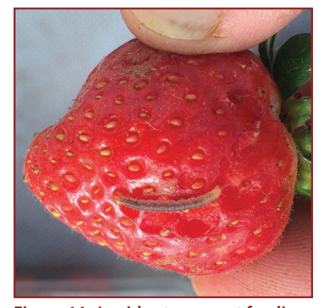
Figure 14: Lepidopteran pest feeding on a strawberry. Heavy infestations can cause heavy yield losses and require producers to take control measures.

Monitor for adults using pheromone traps. Monitor leaves for chewing damage, clusters of lepidopteran frass (small black pellets), or curled leaves. Open curled leaves and open webbing to search for larvae or insect frass.