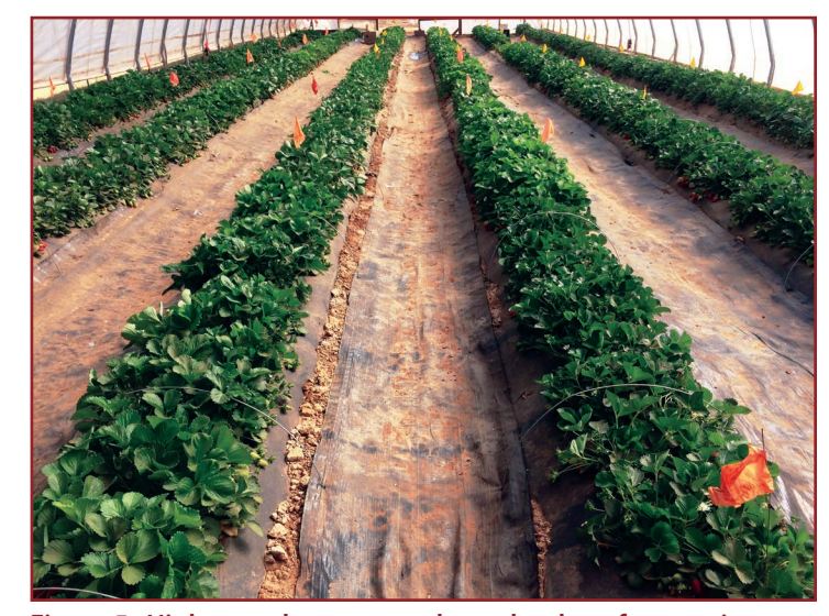
Figure 5: High tunnels are a popular technology for growing strawberries. They can improve yield and quality and extend the growing season.

Other popular systems include growing strawberries in greenhouses using hydroponic gutters or hydrostackers, or in the soil inside high tunnels. High tunnel strawberry production is similar to open field plasticulture, but the crop is protected with a plastic covered frame. Texas A&M AgriLife Extension Specialists have shown high tunnel production to be successful in Texas (Fig. 5).