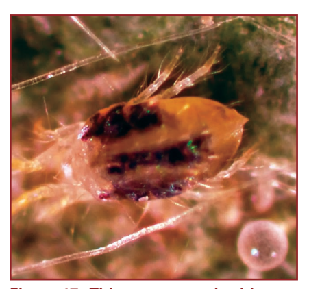
Figure 17: This two-spotted spider mite (with egg, lower right) was found on strawberry plants during December.

leaves from several plants, including the underside and be sure to check each strawberry cultivar since mites may have varietal preferences.