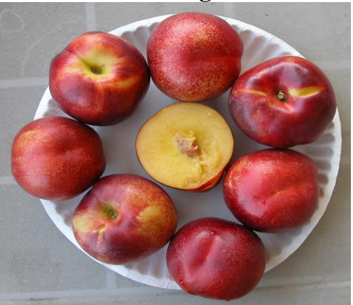
Smooth Delight Two