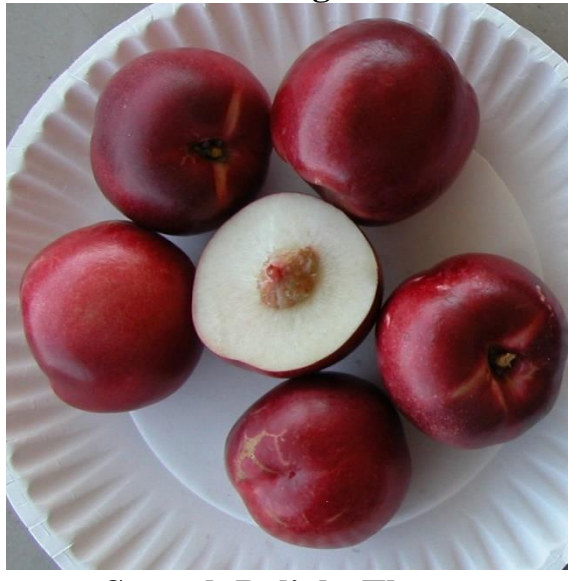
Smooth Delight Three