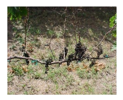
Typical Symptoms of Pierce's Disease