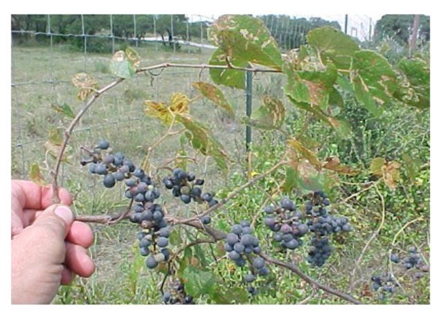
Native Texas Grape Species Such as Vitis berlandieri are Tolerant to Pierce's disease

Grapevine species and varieties vary widely in their susceptibility to PD, and most European, American and French-American hybrid