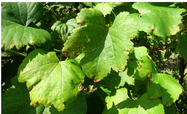
Figure 3. Toxicity symptoms on leaf margins of 'Lenoir' one week after spraying with 1.0% phosphorous acid solution