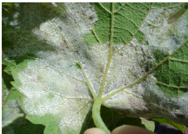
Figure 1. Downy Mildew spores on underside of grape leaf.

Phosphorous acid products are generally less expensive than other DM fungicides and when sprayed on the leaves it enters the plant tissue, then moves via the xylem and phloem into new areas of growth, such as vine shoot tips. This is called amphimobile systemic fungicidal activity and it is advantageous in grapevines because the younger vine tissues are most susceptible to DM infection.