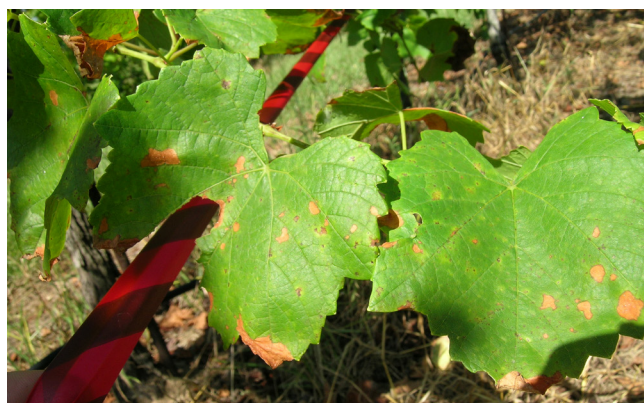
Figure 2. Leaf toxicity symptoms on 'Blanc Du Bois' one week after spraying with 1.0% phosphorous acid solution.

Phosphorous acid also effectively lowered the pH of the spray solution. The pH of the well water was 7.07. Additions of ProPhyt reduced the pH to 6.14 at 0.375 percent, 6.04 at 0.625 percent, and 6.00 at 1.0 percent.