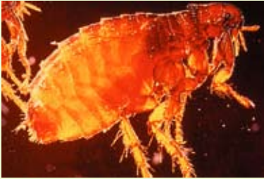
Enlarged photo of a flea