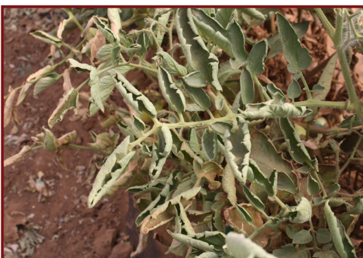
Figure 7. Moderate physiological leaf roll

These symptoms may look like damage from other causes, but if wind damage is the only problem, plant health will generally normalize once weather conditions improve.