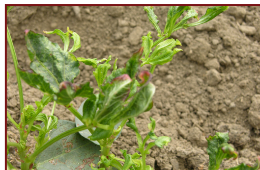
Figure 3. Curling leaves on a bean plant