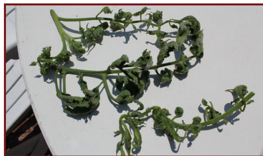
Figure 1. Twisted tomato leaves