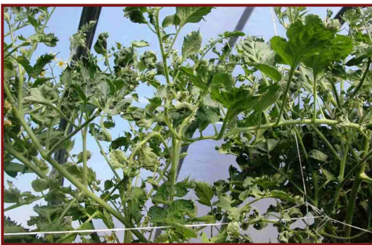
Figure 6. Symptoms of wind injury in tomato often confused with dicamba injury