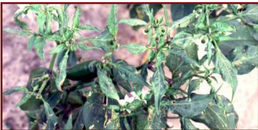
Figure 5. Curling leaves on a pepper plant