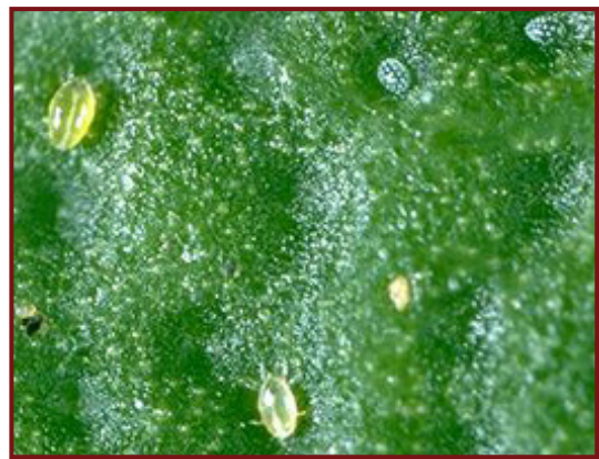
Figure 10. Broadmites and broadmite eggs

If you cannot see the broad mites readily, look for the eggs, which are white, oval-shaped and have ridges or bumps. This mite's eggs are distinct—they look like Christmas ornaments (Fig. 10). Eggs develop into adults in about 4 to 6 days in hot weather and 7 to 10 days in cool weather.