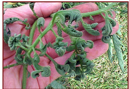
Figure 8. Dicamba injury to tomato leaves

Many home gardens are close enough to cotton and corn fields for drifting 2,4-D, dicamba, or other hormone-type herbicides to cause serious damage. Tomato plants are extremely sensitive to these herbicides: they can be injured by concentrations as low as 0.1 ppm. If only a little of the herbicide reaches the tomato plants, they can recover, but yield will definitely suffer (Fig. 8).