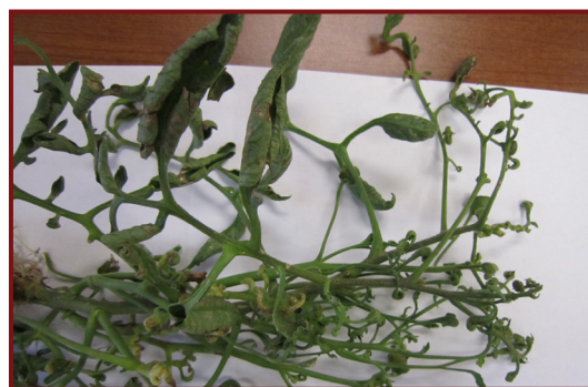
Figure 2. Severely twisted tomato leaves