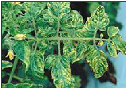
Figure 11. Mosaic patterns on tomato leaves

Hundreds of viruses can cause leaf curling and stunting in tomatoes. Though initial virus symptoms can be confused with a phenoxy-based herbicide damage, the disease often progresses to include yellow-green mosaic patterns on the leaves (Fig 11).