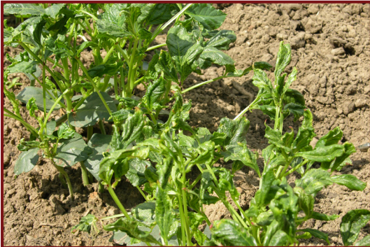
Figure 4. Curling leaves on an eggplant

slightly to prevent further water loss (Fig. 7). Mild leaf roll generally does not lower yields or quality, though severe symptoms may cause flowers to drop and fewer fruit to set.