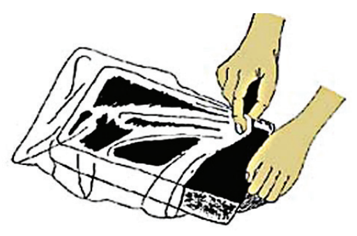
Covering the seed flat with a clear plastic bag will hasten germination.