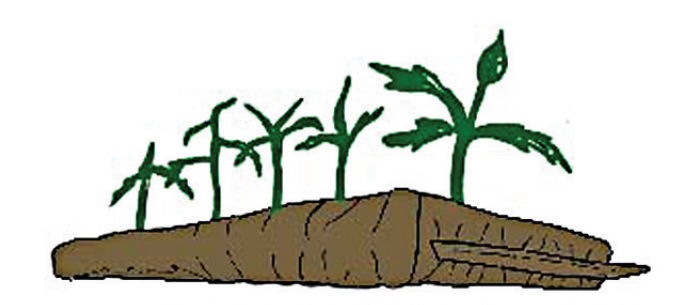
A "tube" or bag garden is an easy method to grow vegetables.

The seed should be started in a warm area that receives sufficient sunlight about 4 to 8 weeks before you plan to transplant them into the final container. Most vegetables should be transplanted into containers when they develop their first two to three true leaves. Transplant the seedlings carefully to avoid injuring the young root system. (See Table 2 for information about different kinds of vegetables.)