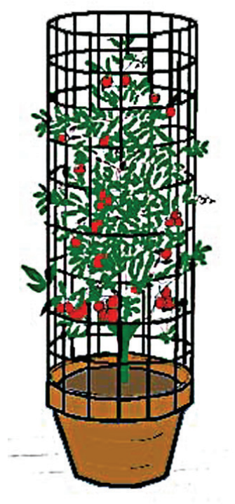
"Cages" can be used with containers to support tomatoes, cucumbers and pole beans.

Nearly all vegetable plants will grow better in full sunlight than in shade. However, leafy crops such as lettuce, cabbage, greens, spinach and parsley can tolerate more shade than root crops such as radishes, beets, turnips and onions. Fruit bearing plants, such as cucumbers, peppers, tomatoes and eggplant need the most sun of all. One major advantage to gardening in containers is that you can place the vegetables in areas where they can receive the best possible growing conditions.