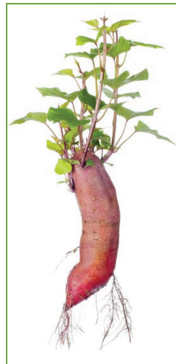
Figure 3. A sweet potato producing slips.

To produce slips, buy healthy, disease-free sweet potatoes from a local market. Scrub them clean and then cut them in half. Suspend each half over a jar of water by inserting toothpicks so that half is submerged in the water.