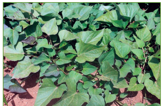
Figure 1. Leafy vines of the sweet potato plant.

Hot days and warm nights are ideal for sweet potato production, which is why Texas is a large sweet potato producer.