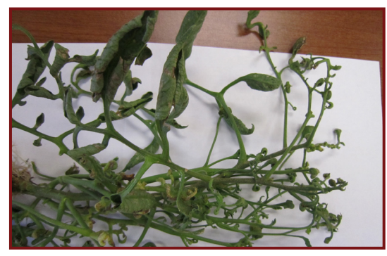
Figure 2. Severely twisted tomato leaves