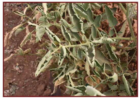
Figure 6. Moderate physiological leaf roll

Mild leaf roll generally does not lower yields or quality, though severe symptoms may cause flowers to drop and fewer fruit to set.