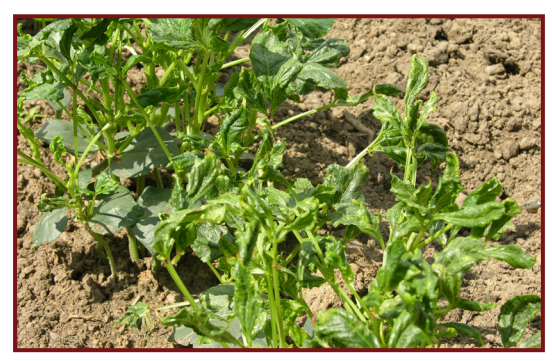
Figure 4. Curling leaves on an eggplant