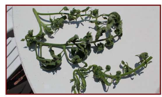
Figure 1. Twisted tomato leaves

Hot dry weather may also cause a symptom called physiological leaf roll. This is a selfdefense response, where leaves and leaflets curl slightly to prevent further water loss (Fig. 6).