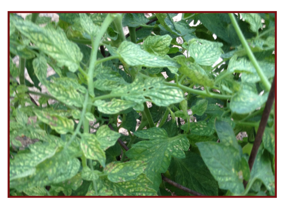
Figure 10. Mosaic patterns on tomato leaves

Hundreds of viruses can cause leaf curling and stunting in tomatoes. Though initial virus symptoms can be confused with a phenoxybased herbicide damage, the disease often progresses to include yellow-green mosaic patterns on the leaves (Fig 10).