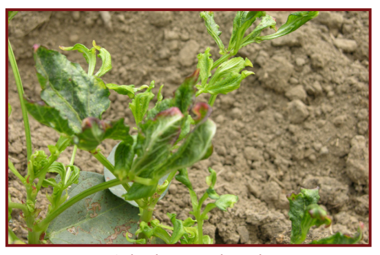
Figure 3. Curling leaves on a bean plant