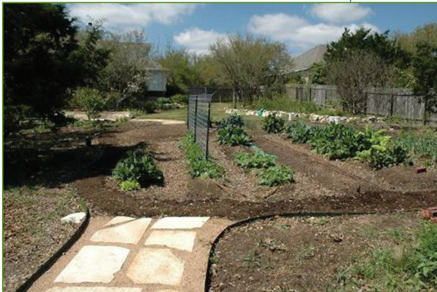
Figure 1. A successful garden begins with a good design.

Do not plant vegetables under the branches of large trees or near shrubs because they rob vegetables of food and water.