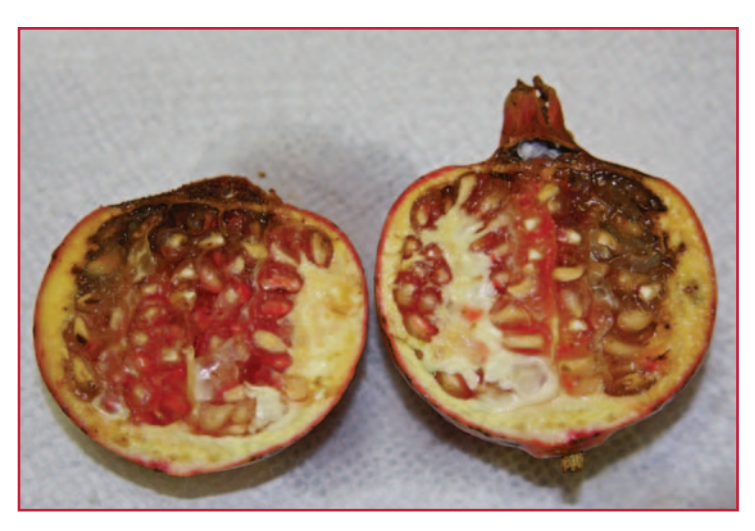
Figure 6. Heart rot.

If you use drip irrigation, use one 1-gallon-per-hour emitter per tree for the first year or two; gradually increase to at least four emitters per tree when the plants are 4 to 5 years old.