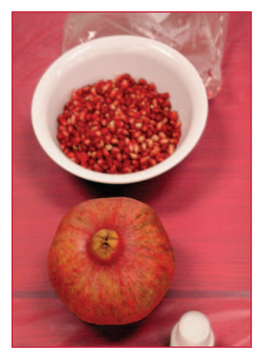
Figure 3. Fruit and arils of the 'Wonderful' pomegranate variety.

as 10°F; others are damaged at 18°F. They are grown as far north as Zone 7b of the U.S. Department of Agriculture Hardiness Zone Map (Fig. 4).