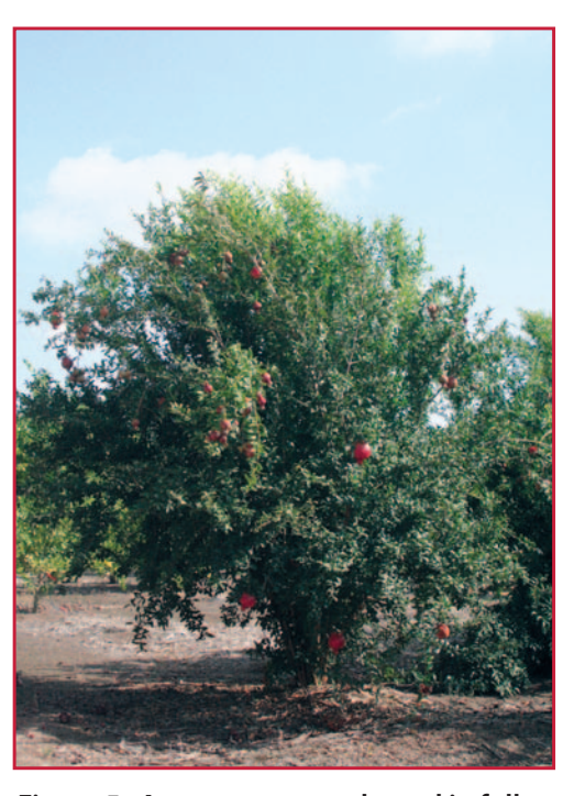
Figure 5. A pomegranate planted in full sun.

Organic mulch or weed barrier fabric can be used to conserve soil moisture and to prevent weed and grass competition.