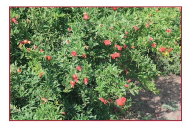
Figure 1. A pomegranate shrub.

Pomegranates grow well in areas with hot, dry summers. Some varieties can tolerate temperatures as low