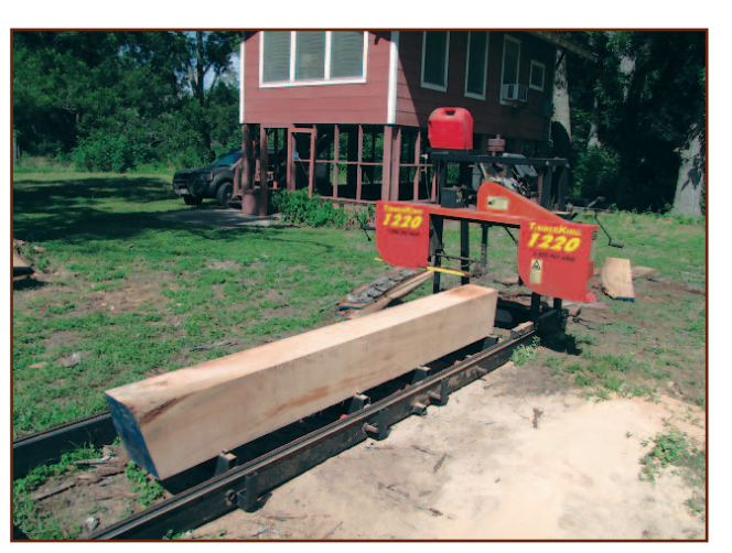
Figure 6. Small sawmills can be used to mill pecan logs into pecan lumber.

these portable sawmills cut and dry timber for their own use or for retail sale (Fig. 6).