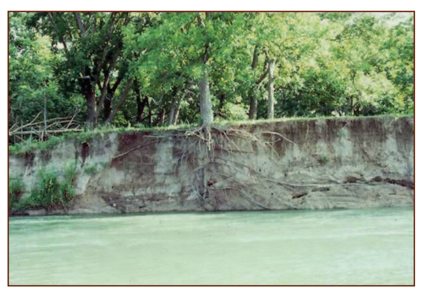
Figure 2. Deep soil is characteristic of native pecan bottoms.