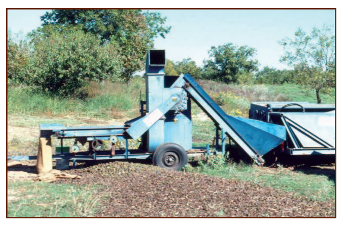
Figure 8. A pecan blower or vacuum separator removes foreign materials from the harvested nuts.

Cone and trunk traps can help you determine when to spray. For the weevil to lay its eggs, the pecans must be in the gel or