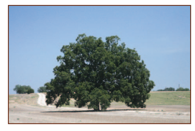
Figure 4. Isolated trees are vulnerable to birds and other nut eaters.