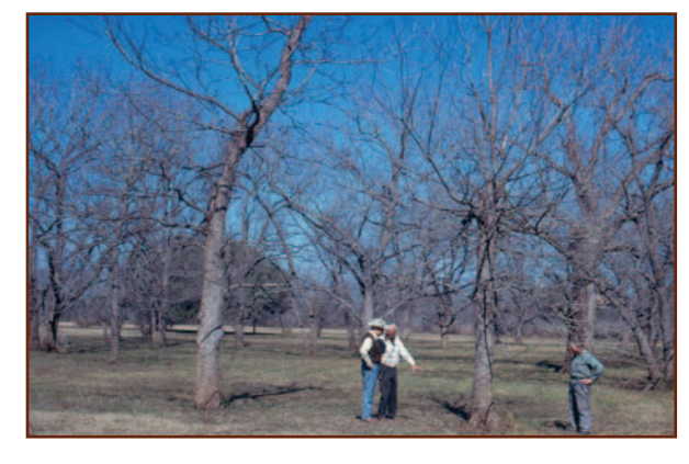
Figure 3. Weak trees should be removed early in the renovation process.

Grafted trees need more care than those not grafted. If you do not provide this care, the trees are better left as natives.