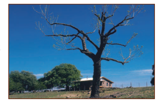
Figure 5. A native tree can be topworked (grafted) to an improved variety.