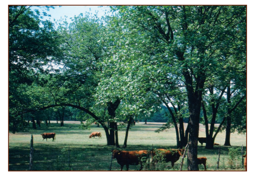
Figure 1. Grazing is an integral part of native pecan management; ideally, the animals should be removed 45 days before harvest.

When determining whether it would ideally, the animals be economically feasible to improve your site, consider the soil depth, flooding potential, management options, pest control, and harvest requirements. A native pecan management program may include nut production as well as livestock grazing (Fig. 1) and recreational hunting.