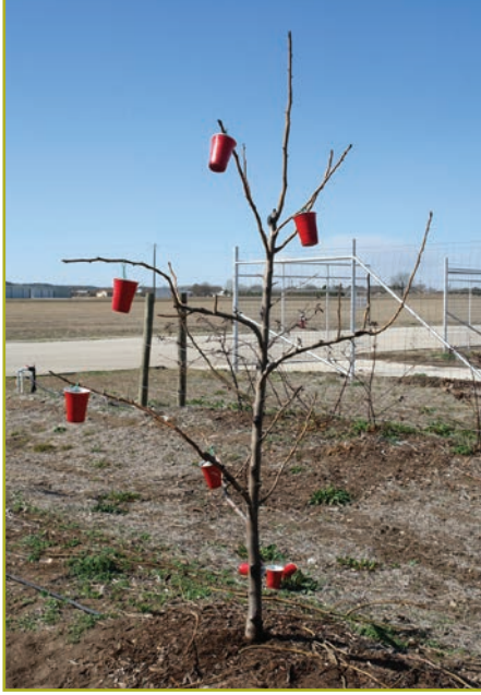
Figure 3b. The tree after pruning and after weights were added to help spread the limbs.