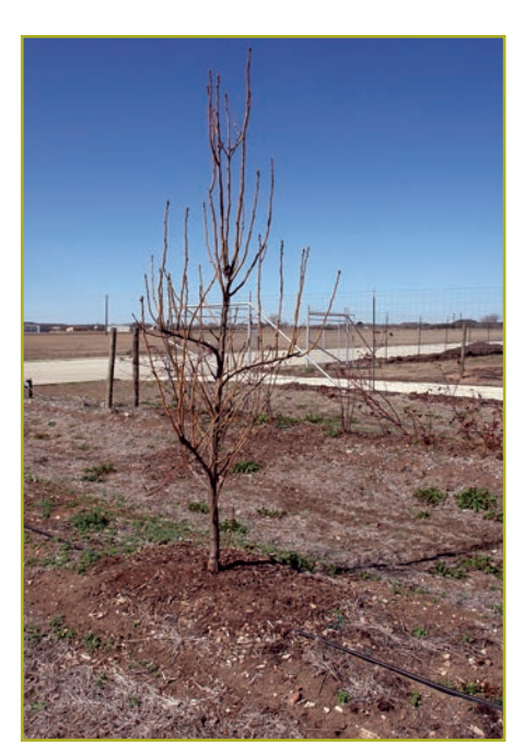
Figure 3a. Third-year dormant pear tree, before pruning.