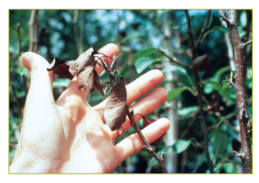
Figure 7. A shoot tip blackened by fire blight.