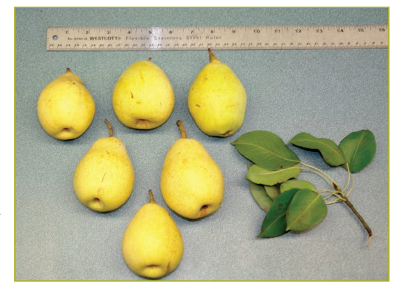
Figure 1. European hybrid pears.

Common varieties of true European pears, Pyrus communis , include 'Bartlett', 'Bosc', and 'Anjou'. Their success in Texas is limited by the bacterial disease known as fire blight in all but arid Far West Texas. Many of these varieties require more than 1,000 hours of winter chilling (below 45°F), which is more than is received in all but the Davis Mountains and the High Plains in Texas.