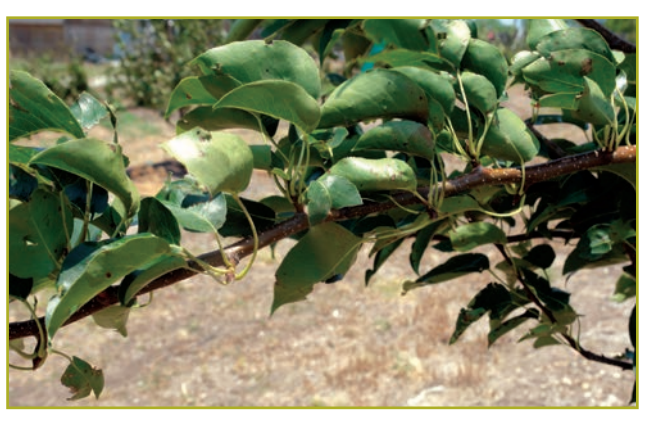
Figure 4. Many short lateral spurs that were encouraged by limb spreading.

Pears are typically trained in one of two systems: