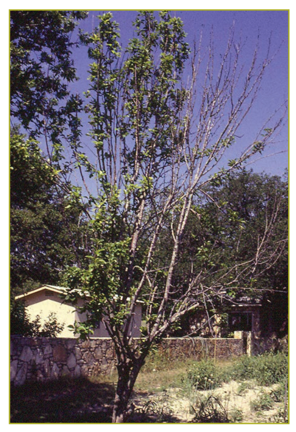
Figure 6. A pear tree damaged by fire blight.