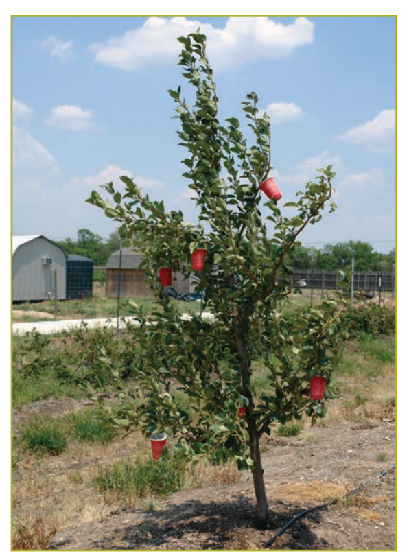
Figure 5. Weights on a pear tree to help spread the limbs and encourage lateral growth.

The main line of defense against fire blight is to choose the correct varieties for your location. However, some fire blight infection is inevitable because high rainfall, especially during bloom or in the heat of sum-