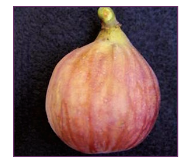
Figure 6. 'Blue Giant'