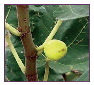
Figure 8. 'Lemon'