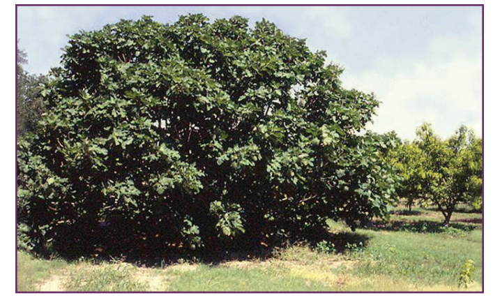
Figure 1. Multi-trunked fig tree

Although commercial fig cultivation in Texas has been largely unsuccessful, small dooryard plantings can meet a family's needs and provide some limited income from local sales. Because figs must be ripened on the tree and are quite perishable, even modest commercial ventures must have well-planned marketing strategies