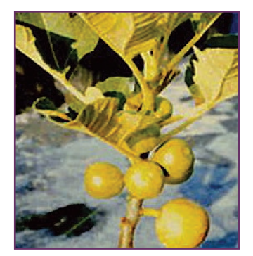
Figure 2. 'Alma'