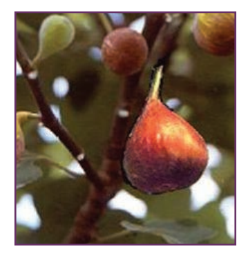
Figure 4. 'Texas Everbearing'