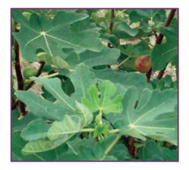
Figure 7. 'Bornabat'