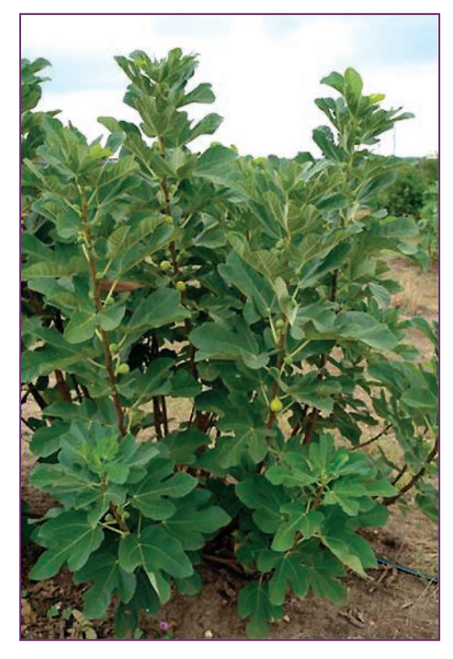
Figure 10. Young, multi-trunk fig trees

To minimize freeze injury during dry falls and winters, thoroughly water the fig trees a few days before a hard freeze. Figs can usually tolerate sus-