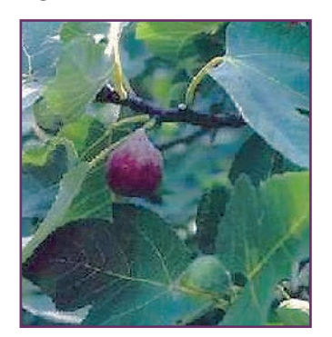
Figure 3. 'Celeste'