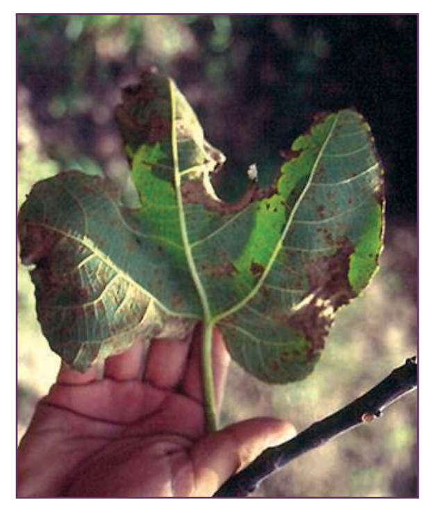
Figure 12. Fig rust on foliage

Figs bear their first crop in late spring, but many varieties produce a larger crop in late summer through fall. When frozen to the ground, the fall crop may be smaller, delayed, or in some varieties, absent.