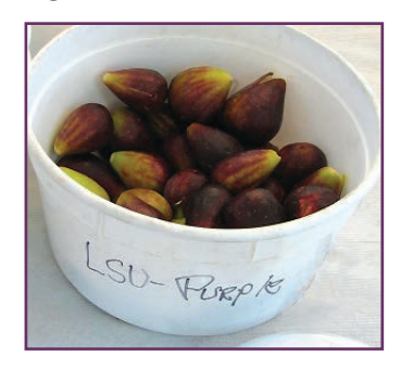
Figure 9. 'LSU Purple'