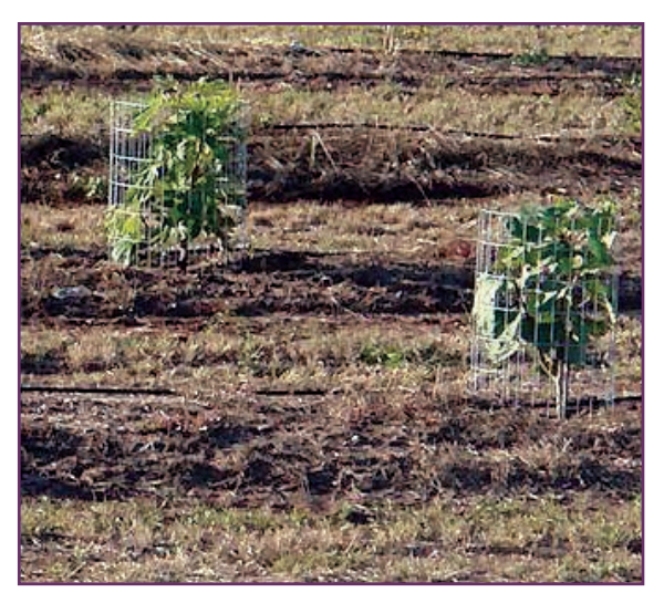
Figure 11. Young fig plants fitted with wire cages to be packed for freeze protection

tained temperatures to 17°F, but young plants and young, tender trunks are more susceptible than are older, mature trunks.