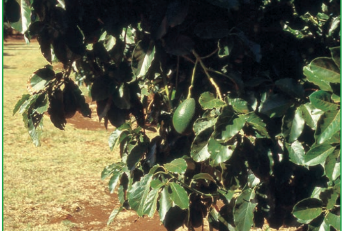
Figure 1. Avocado fruit and leaves.

Hybrids of all three species have created additional varietal types. Blooms form from January to March, with the fruit maturing in as few as 6 months for Mexican types and 18 months for Guatemalan types.