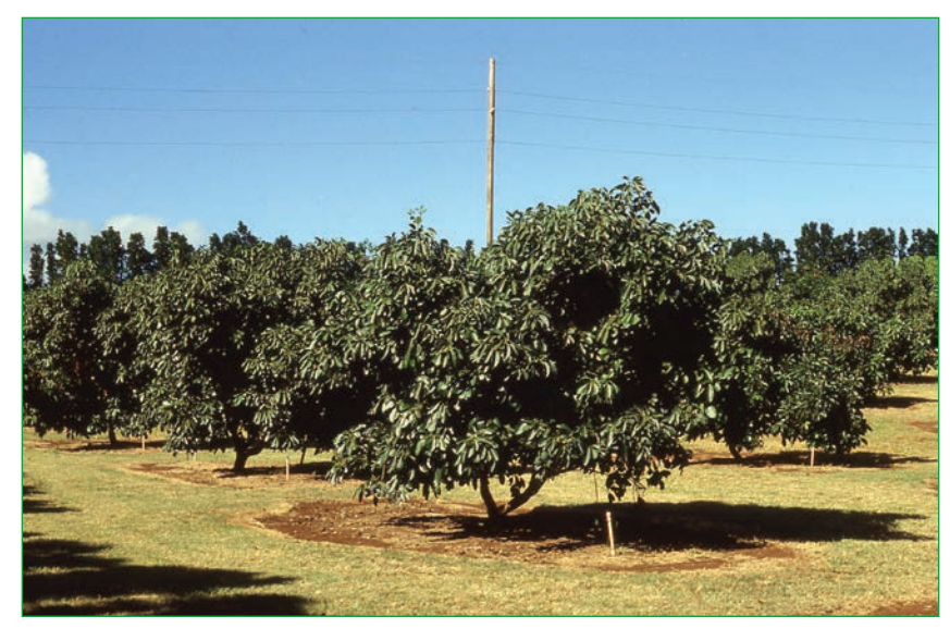
Figure 4. Avocado trees spaced 20 to 30 feet apart.

When choosing a site, keep cold protection in mind, especially where frosts or freezes are common. In a residential site, the south or southeast side of a house or shed is generally the warmest at night because of north wind protection and the sun's warmth radiating from the structure.