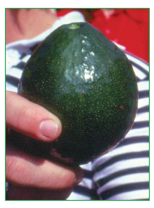
Figure 3. 'Lula'.