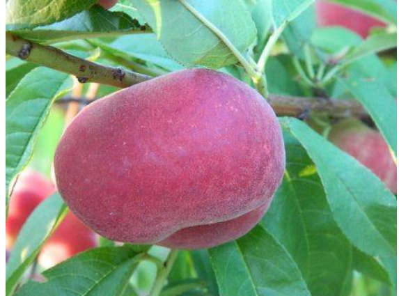
Flat Delight One