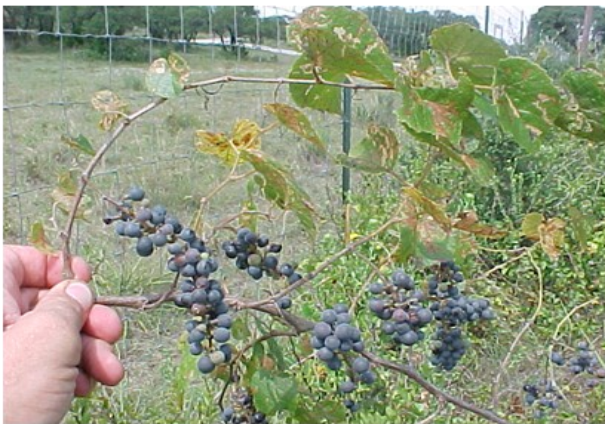
Native Texas Grape Species Such as Vitis berlandieri are Tolerant to Pierce's disease

Grapevine species and varieties vary widely in their susceptibility to PD, and most European, American and French-American hybrid