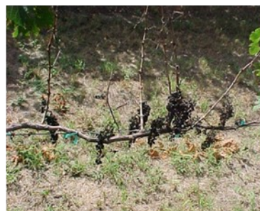
Typical Symptoms of Pierce's Disease