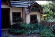
Informal: Texas Cottage Garden