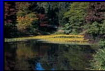
Informal: Naturalistic Pond