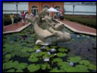
Formal: Structured Water Garden