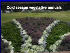
Cold season vegetative annuals