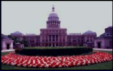
Formal: Texas Capital Grounds