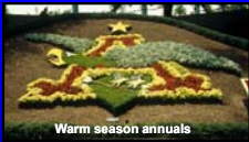
Warm season annuals