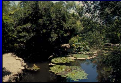
Naturalistic plantings ≠ native plants