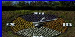
Cold season flowering annuals