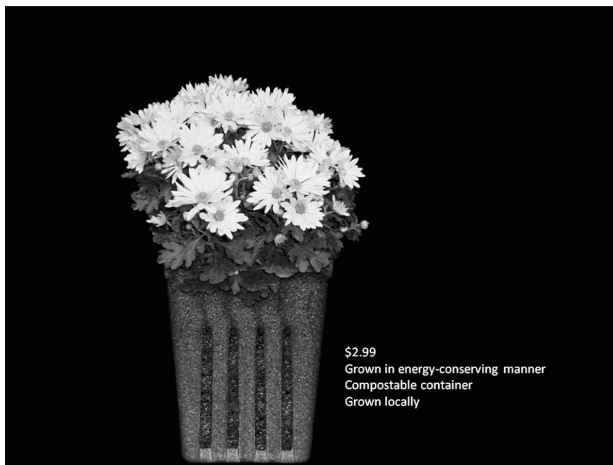
Fig. 3. Image of chrysanthemum ( Chrysanthemum cv.) with explanatory text shown to 2511 participants in an online survey in May 2011.

termed origins into three categories: local, regional, and international. Although there is no exact definition, a geographical ordering is imposed such that local is closer to home than regional and regional is produced closer to home than international. Because a full design would have required the evaluation of 144 products, we used a fractional factorial design to produce a manageable number of product profiles, 16. The profiles consisted of pictures representing the plant type (see Figs. 1, 2, and 3) in the potting container with