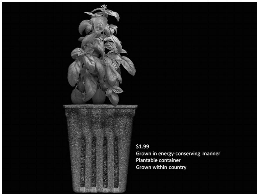
Fig. 2. Image of basil ( Ocimum basilicum ) with explanatory text shown to 2511 participants in an online survey in May 2011.