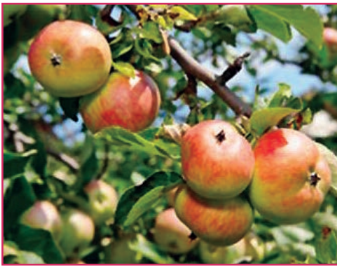
Figure 4. 'Anna'