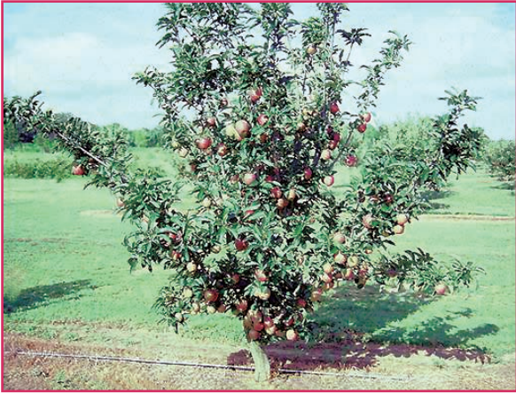
Figure 1. Apple tree at harvest

In Texas, apples ripen from July to October (Fig. 1), depending on the variety, and the flavor of Texas-grown apples can be outstanding. However, if nights are warm during fruit ripening, the color of red varieties can be poor, a problem for commercial producers in the wholesale market. The in-hand eating quality of these apples is unaffected for homeowners and local sales.