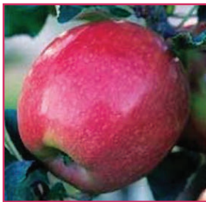
Figure 5. 'Fuji'