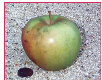
Figure 8. 'Mutsu'