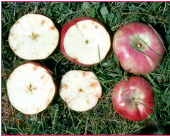
Figure 10. Bitter pit disorder