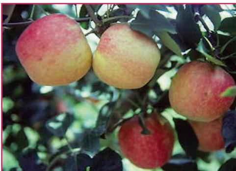
Figure 6. 'Gala'

area should have a chilling requirement within 150 hours of the average winter chilling. If the chilling requirements are too low, bloom can occur too early in the year, and later spring freezes and frosts can reduce or destroy the crop.