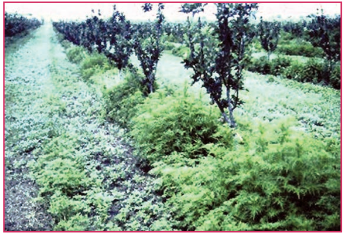
Figure 12. Inadequate weed control in apple tree rows

Collar rot ( Phytophthora cactorum ) is a soil-borne disease problem of apples in Texas. The incidence of collar rot can be