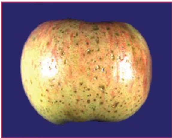
Figure 11. Lenticel blotch pit