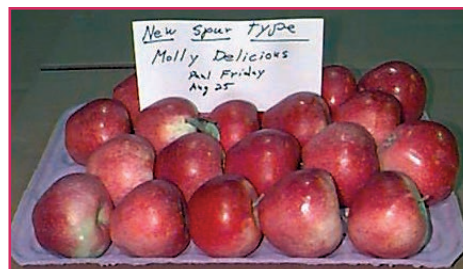
Figure 7. 'Mollie's Delicious'

For areas with more than 400 hours of winter chilling, suitable apple varieties include 'Fuji', 'Gala', 'Imperial Gala', 'Mollie's Delicious', 'Mutsu', 'Pink Lady', and 'Royal Gala'. In areas receiving 400 or fewer hours of chilling, two varieties will grow and fruit reliably: 'Anna' and 'Dorsett Golden' (Table 1, Figs. 4 through 8).