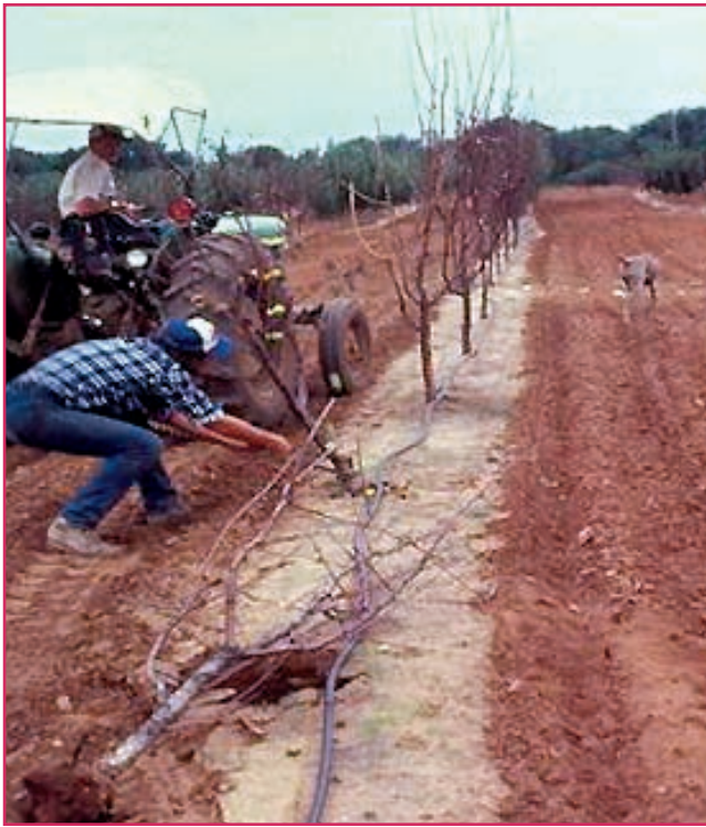
Figure 13. Pulling up trees killed by cotton root rot

reduced by proper site and rootstock selection and managed with fungicide applications as needed.