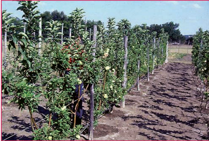
Figure 9. Trellised apple trees